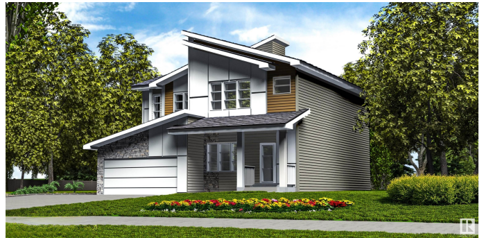
The Deveraux | 1,411 Sq. Ft.

MLS® # E4433250 Price $457,900 Bedrooms 3